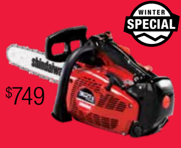
451s REAR HANDLE CHAINSAW